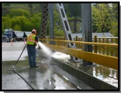
Below: Jim Kastrukoff - Bridge Washing on the Yale Bridge in Grand Forks