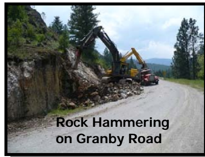
Rock Hammering on Granby Road