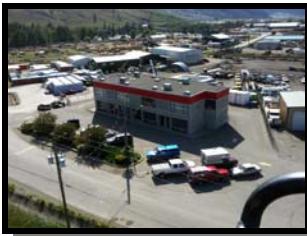
Emcon Services Inc. Corporate Office Merritt, BC